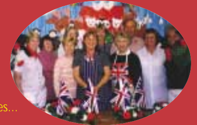
Our Dinner ladies...

The population doubles during the summer and Bank holidays with visitors to the popular holiday camps, small hotels and excellent camp sites.